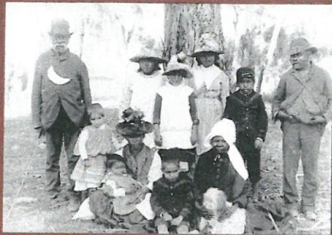
Kamberri group photo taken at Lanyon circa 1896.